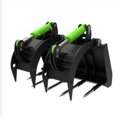
Forks with retainer